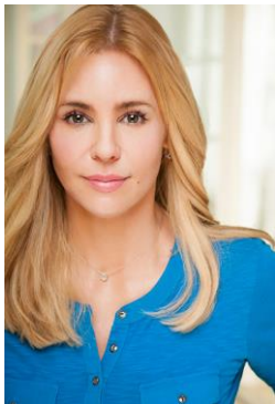
Olivia d'Abo "GRACE BAXTER"

Olivia Jane d'Abo is a British actress and singer. She is known for her role as Karen Arnold, Kevin Arnold's rebellious teenaged hippie sister in the ABC comedy-drama series THE WONDER YEARS (1988–1993), female serial killer Nicole Wallace in LAW & ORDER: CRIMINAL INTENT , Marie Blake on THE SINGLE GUY (1995–1997), and Jane Porter in THE LEGEND OF TARZAN (2001–2003). In 1992, she guest starred in the STAR TREK: THE NEXT GENERATION episode titled "True Q" as Amanda Rogers, as well as starring as Jedi Master Luminara Unduli in STAR WARS: THE CLONE WARS (2008). Her film appearances include roles in CONAN THE DESTROYER (1984), BANK ROBBER (1993), and STAR WARS: THE RISE OF SKYWALKER (2019).