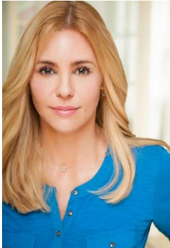
Olivia d'Abo "GRACE BAXTER"

Olivia Jane d'Abo is a British actress and singer. She is known for her role as Karen Arnold, Kevin Arnold's rebellious teenaged hippie sister in the ABC comedy-drama series THE WONDER YEARS (1988–1993), female serial killer Nicole Wallace in LAW & ORDER: CRIMINAL INTENT , Marie Blake on THE SINGLE GUY (1995–1997), and Jane Porter in THE LEGEND OF TARZAN (2001–2003). In 1992, she guest starred in the STAR TREK: THE NEXT GENERATION episode titled "True Q" as Amanda Rogers, as well as starring as Jedi Master Luminara Unduli in STAR WARS: THE CLONE WARS (2008). Her film appearances include roles in CONAN THE DESTROYER (1984), BANK ROBBER (1993), and STAR WARS: THE RISE OF SKYWALKER (2019).