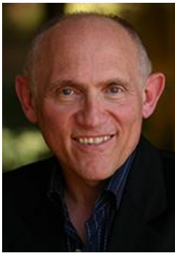
ARMIN SHIMERMAN "ROY"