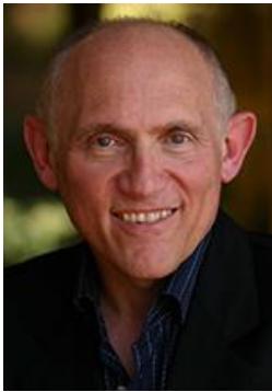
ARMIN SHIMERMAN "ROY"