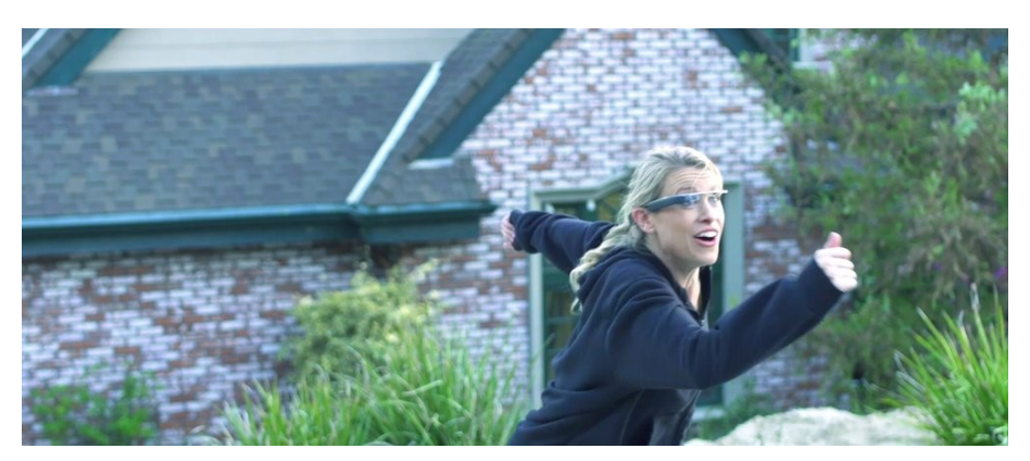
The Assassin's Apprentice

We hope to introduce our audience to our characters and storylines, as we expand our TAA franchise to include games and feature-length sequels.