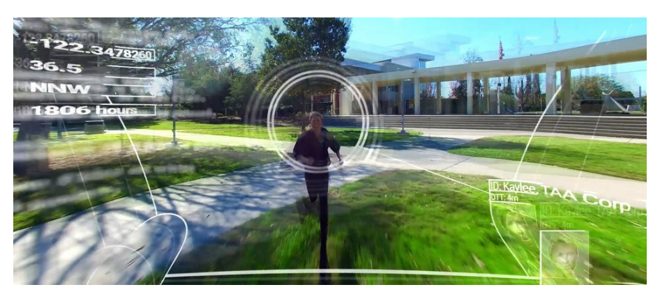
The Assassin's Apprentice